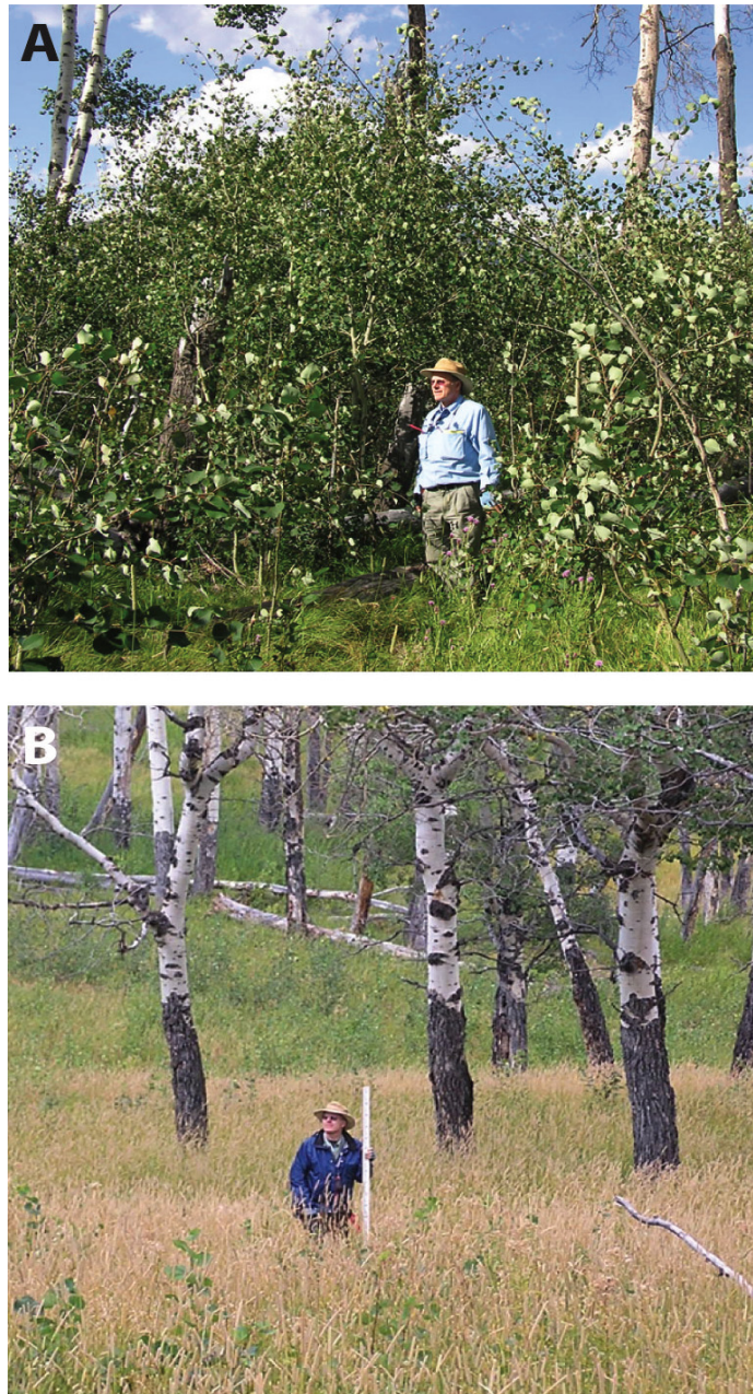
Fig. (2). August 2006 photographs of (A) recent aspen recruitment (aspen 3-4m tall) in a riparian area along Lamar River and (B) a lack of recent aspen recruitment (aspen <1m tall) in an adjacent upland. These differences shown in aspen heights were likely due to differences in perceived predation risk due to differences in escape terrain. (Ripple and Beschta 2007).

daily foraging decisions (Brown et al. 1994, Brown and Kotler 2004).